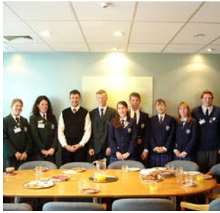
Instep Young Leaders, Breakfast with the Mayor of Tauranga 2003