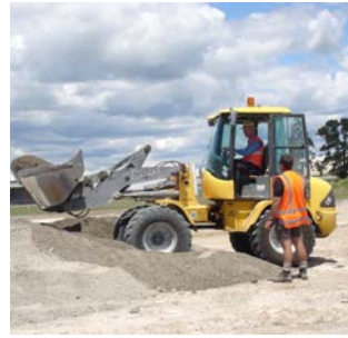
Principals Day Out at Higgins with Aquinas College 2005