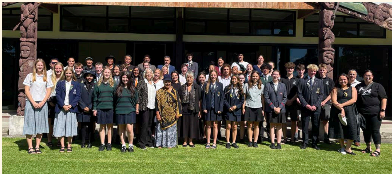
2023 Priority One Instep Young Leaders with Kaumātua and Partners at Hungahungatoroa Marae.

The Instep Young Leaders' Forum (IYLF) is a programme led by Priority One, which provides Western Bay of Plenty secondary school students an opportunity to develop leadership skills and gain insights into various industries. This year, we are excited to announce that the forum will be bigger and better than ever before, with a range of engaging activities and learning opportunities for all leaders.