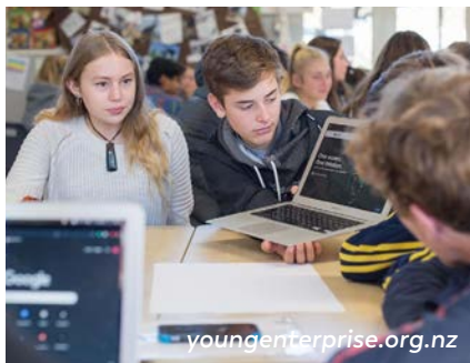
Young Enterprise Scheme