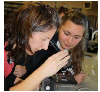
PathLab Career Day 2012

Priority One's Instep programme supports our community's pipeline of future talent by fostering a partnership between local business and schools. It recognises that for Tauranga Moana to have a sustainable supply of the talent local businesses need to invest in our young people. They need to inspire them about future training and career opportunities available locally, as well as helping them develop the work-ready skills needed to thrive in a world of change.