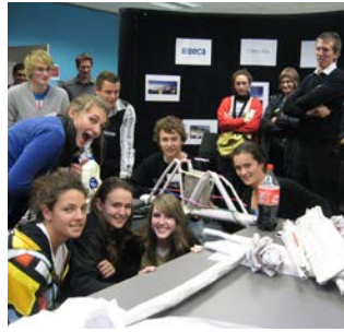
BECA Career Day 2005