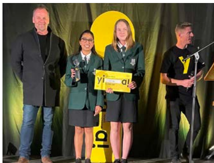
Young Innovators (yip!) programme

There are several opportunities for students to participate in projects or activities that support personal empowerment and develop leadership skills. We look forward to seeing you get involved. Some of these include: