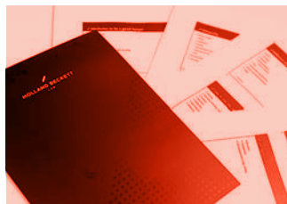
Priority One Instep | HOBEC Law Careers Seminar