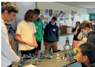
Priority One Instep | BECA Careers Day

There's always heaps going on in the Western Bay of Plenty between Instep and various partners, so click through to read about some of the recent education-related highlights.