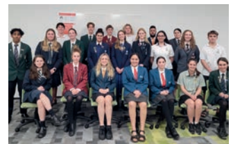
Celebration of Dale Carnegie 2022 Scholarship Winners