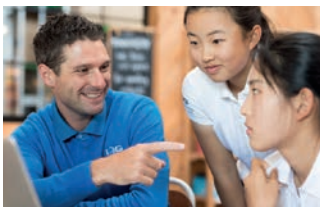
Career Connect: The international students' online resource hub