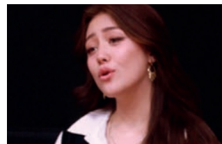
Applications open for scholarships to support creative arts in the Bay