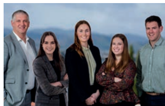
Sharp Tudhope Lawyers launch law scholarship for students