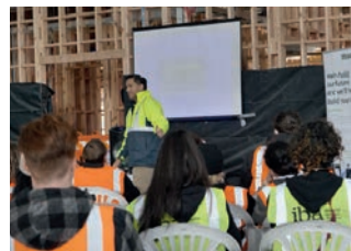
Ara Rau Industry Open Day | Higgins - Building pathways