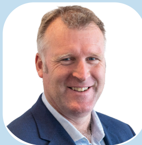
His Worship Mahé Drysdale Mayor, Tauranga City Council