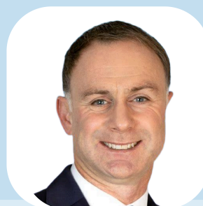
Hon Simon Watts Minister of Local Government