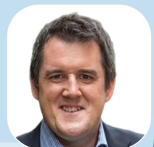
Hon Chris Bishop Minister for Infrastructure